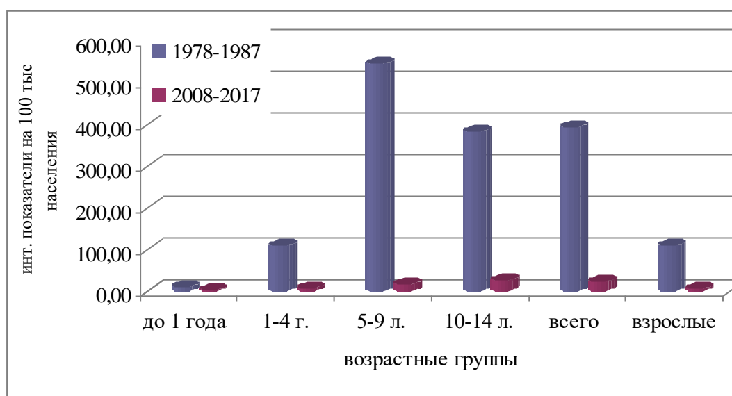
Fig. 2. Dynamics of age-related incidence of HA (M) in Odessa region in 1978-1987 and 2008-2017.

Note: - no data, since 2010, the nomenclature of the registration of the incidence rate for children's age groups has changed.